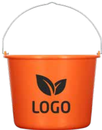
Dimensions/place of printing